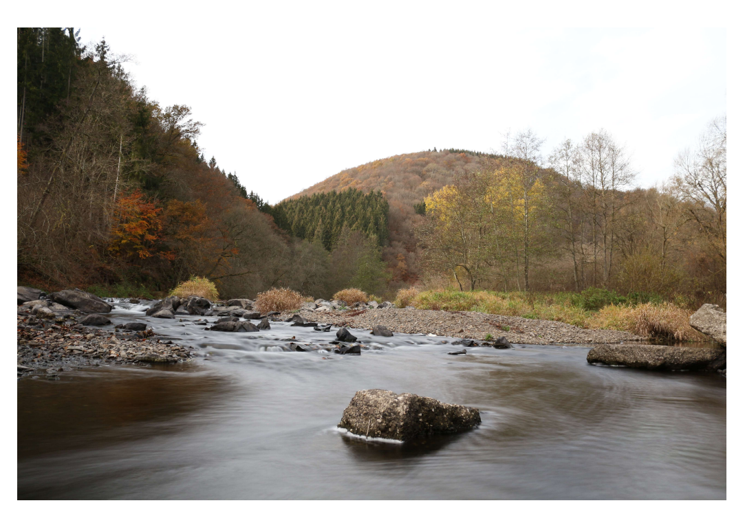
Transformed weir at the mill of Kalborn