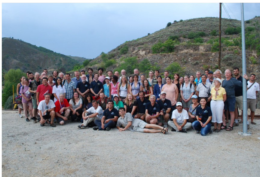
Participants of the Braganca Meeting